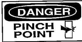
Pinch Point Label