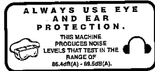
Protective Equipment Label