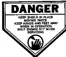
Pinch Point Label