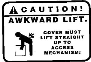
Lifting Caution Label (Not Included on PL410)